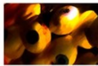
Creepy Aliexpress Ep2